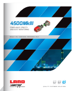
MODEL 4500mkIII COMPLIANCE DUST AND OPACITY MONITOR

SEE OUR OTHER DUST AND OPACITY RELATED LITERATURE: