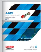
MODEL 4400 OPACITY MONITORING

DISCOVER HOW OUR BROAD RANGE OF NON-CONTACT TEMPERATURE MEASUREMENT AND COMBUSTION & EMISSIONS PRODUCTS OFFER A SOLUTION FOR YOUR PROCESS