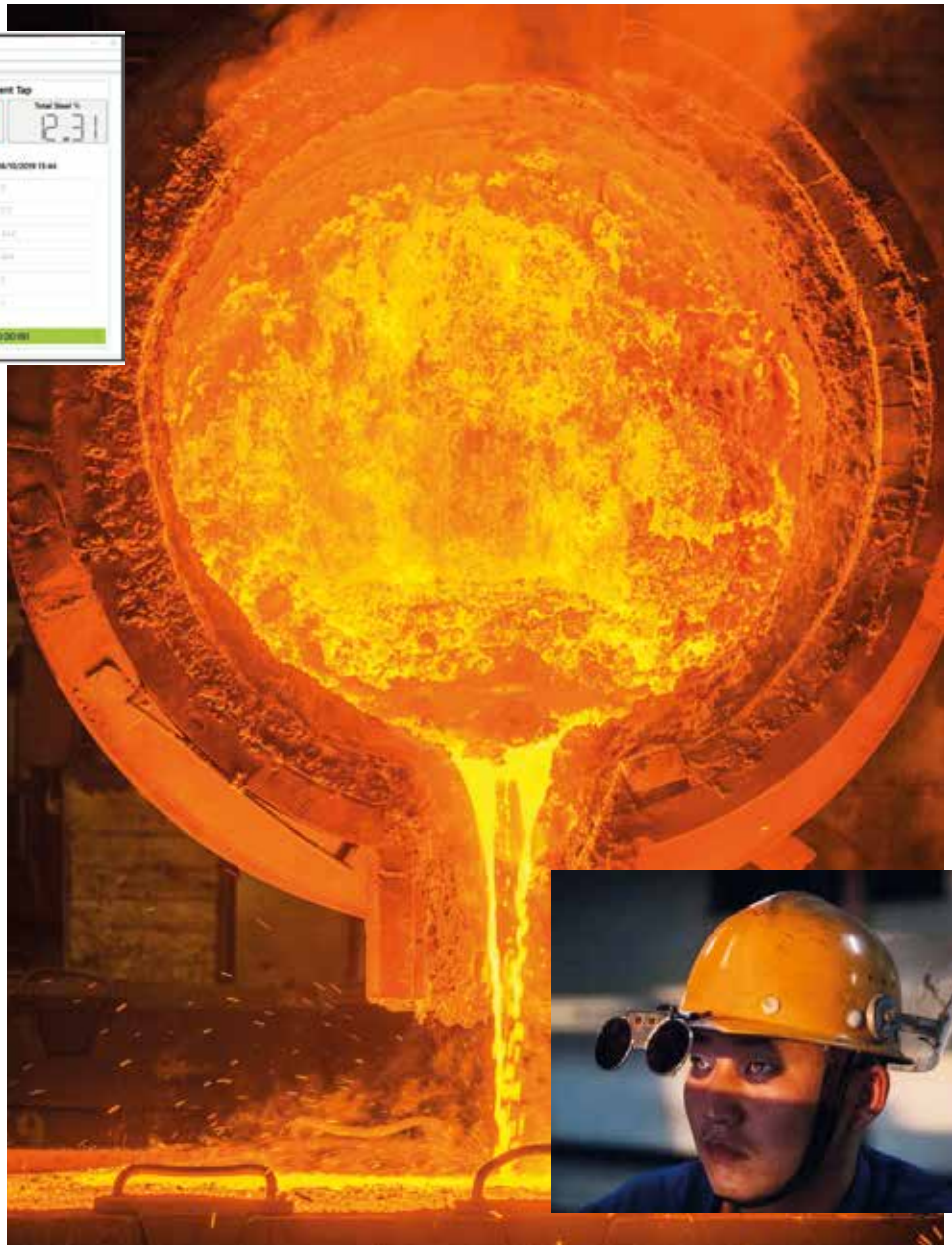
Molten iron is tapped at regular intervals