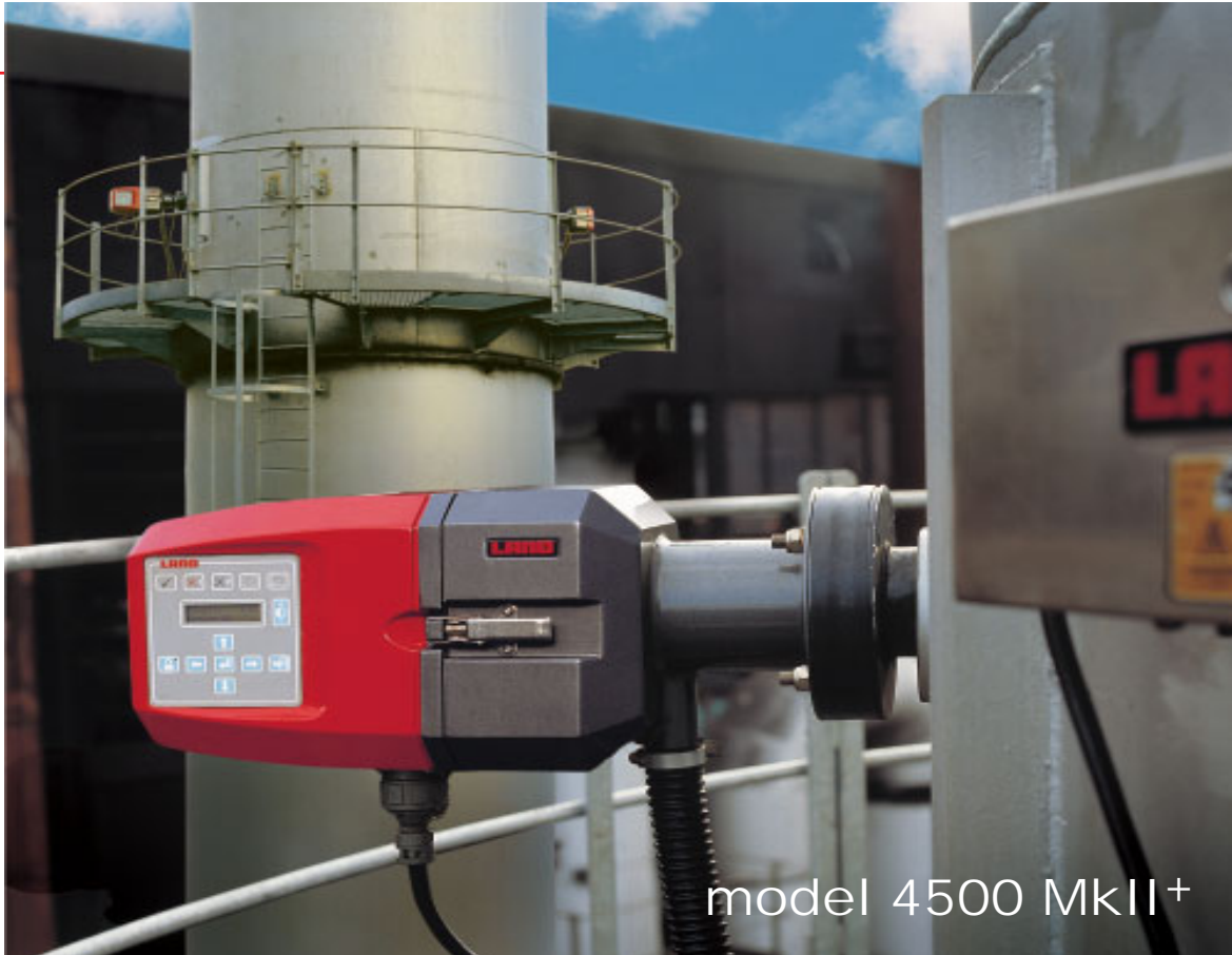
model 4500 MkII+