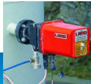
Dust monitoring on a roadstone coating plant