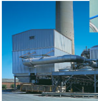
Opacity monitoring on a municipal waste incinerator

The patented dual LED technology of the Model 4200 has proven itself worldwide as stable, reliable and trouble free. The lightweight and compact design makes it ideal for a wide range of applications. Simple installation, low maintenance and ease of operation ensure immediate results - vital where performance, cost and compliance benefits are of high priority.