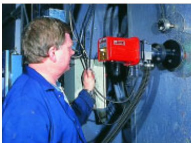
Dust monitoring on a coal-fired boiler

The instrument alternates between the measurement and flood LEDs every second to eliminate drift and maintain accuracy.