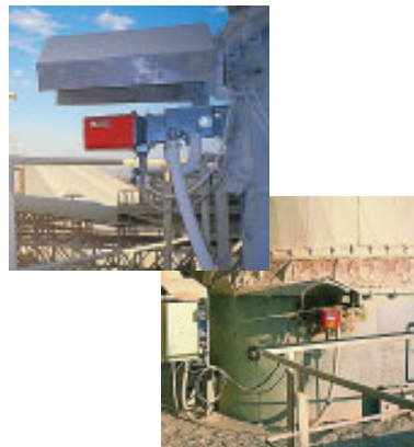
Dust monitoring on a cement plant